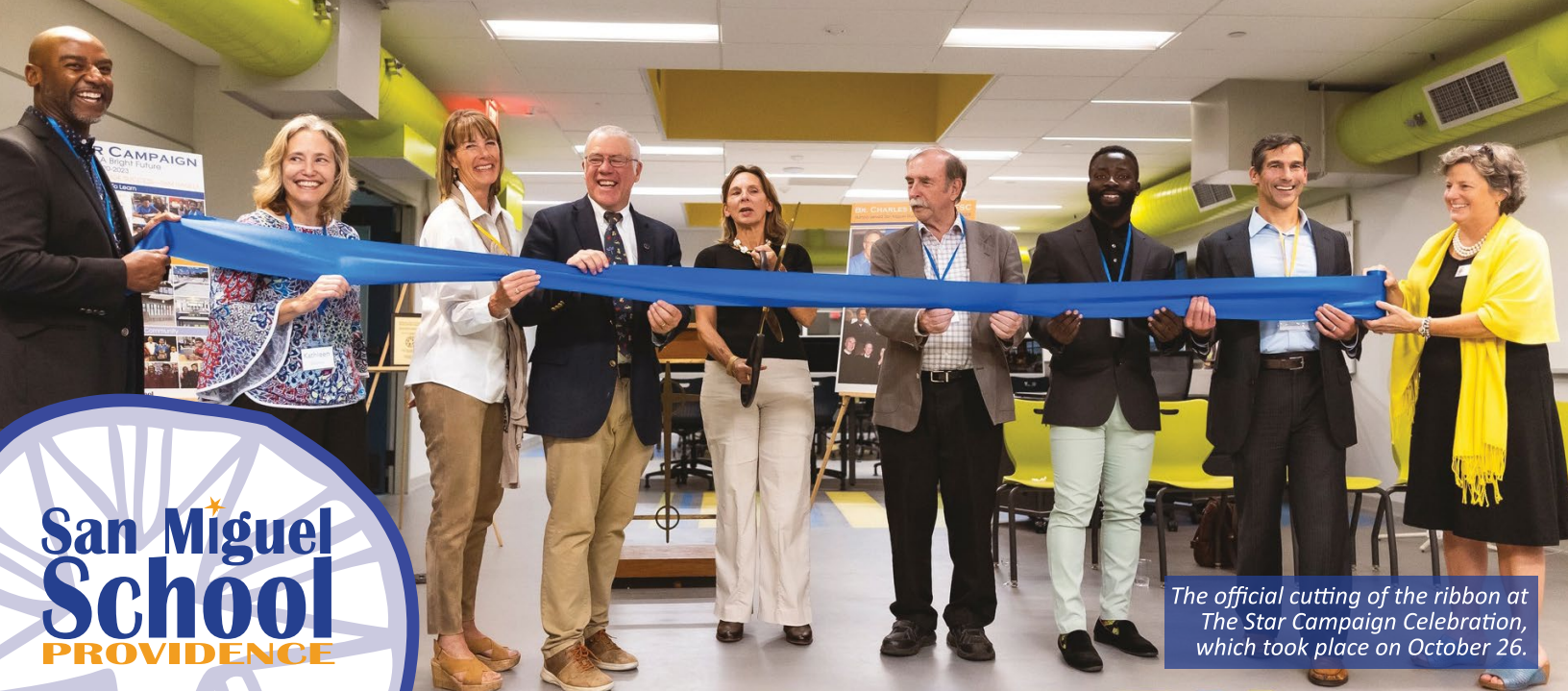
The official cutting of the ribbon at The Star Campaign Celebration, which took place on October 26.