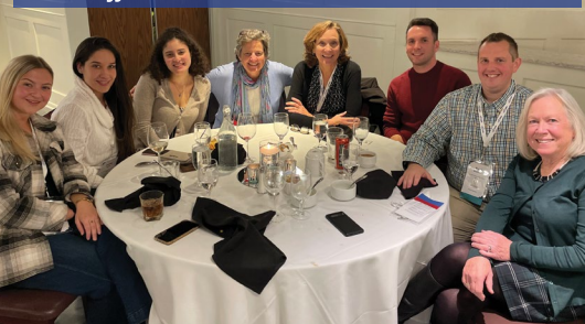
SMS staff members at Huether's District Dinner.

On January 18, a group of Lasallians from Miguel schools located in the District of Eastern North America (DENA) gathered in Eatontown, New Jersey for two days (shown above). The main purpose of this gathering was to provide an opportunity for members of each school community to join together to share ideas and best practices that may or may not be unique to their schools, while simultaneously building community with one another and reaffirming the shared mission that lies at the heart of the Miguel network. All of this, and more, made for an incredibly meaningful time together. We are so grateful to have had both opportunities!